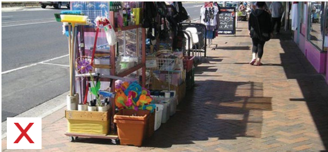
Goods must not be unsightly. manner