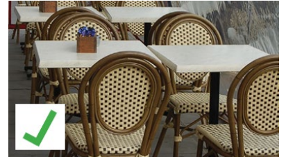
Chairs must not back on to a pedestrian zone.