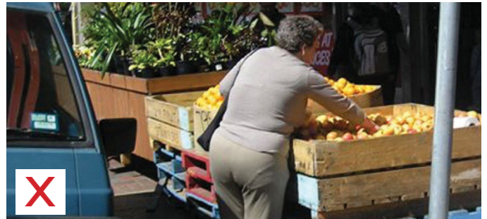
Goods must be secured, protected and displayed in a safe