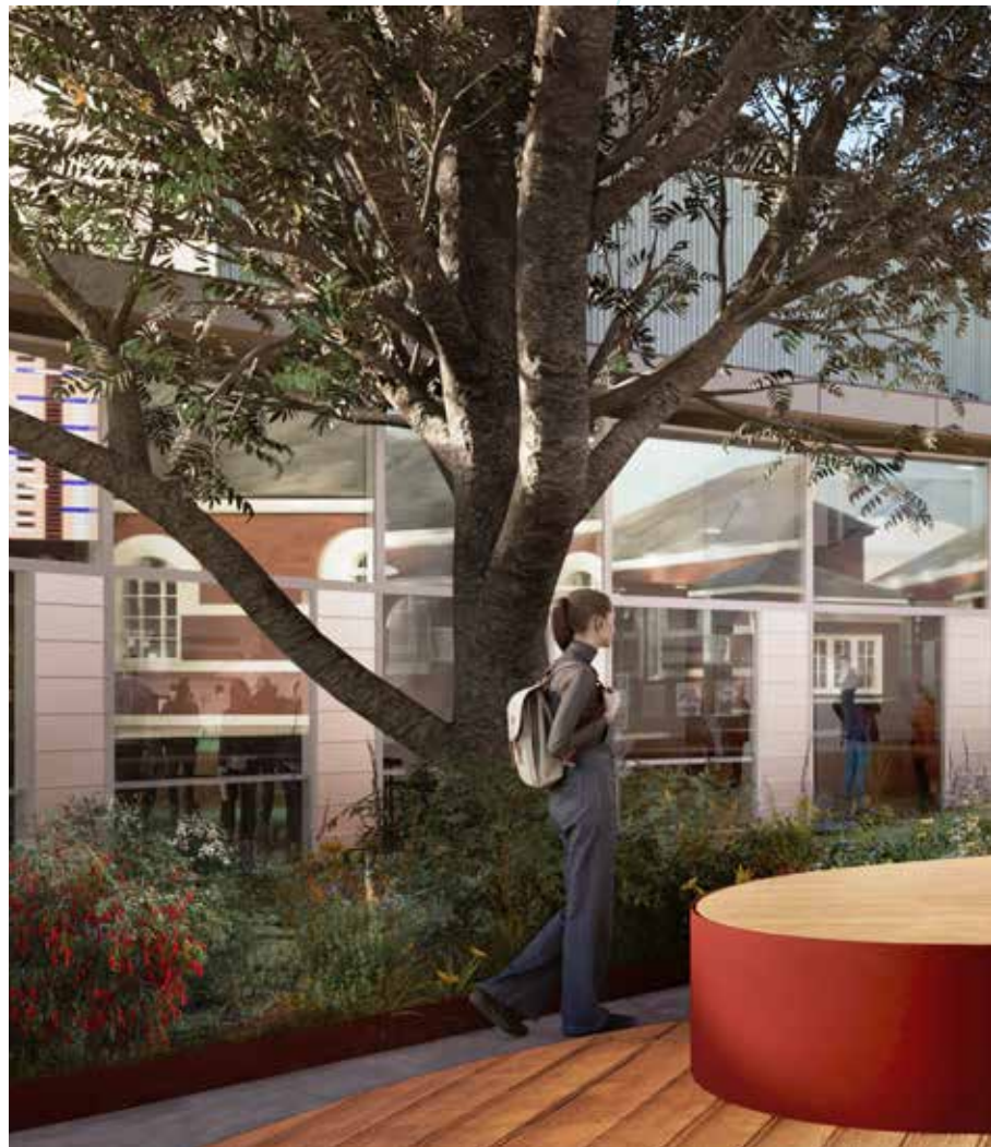
Right: The precinct gardens provide areas for performances, seating and events.