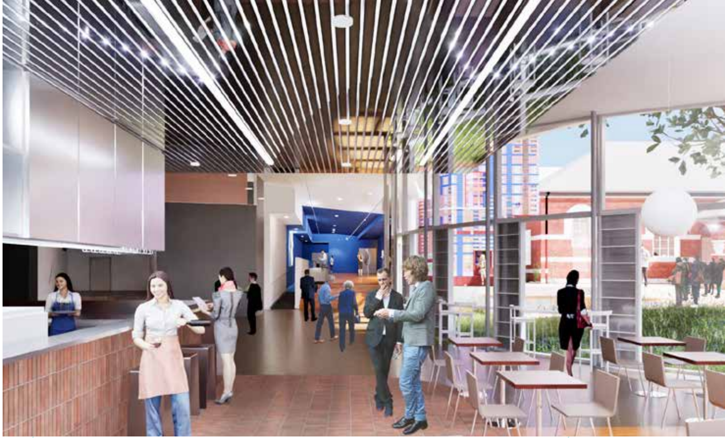
Above: The café leading through to the gallery foyer, with views of the garden.