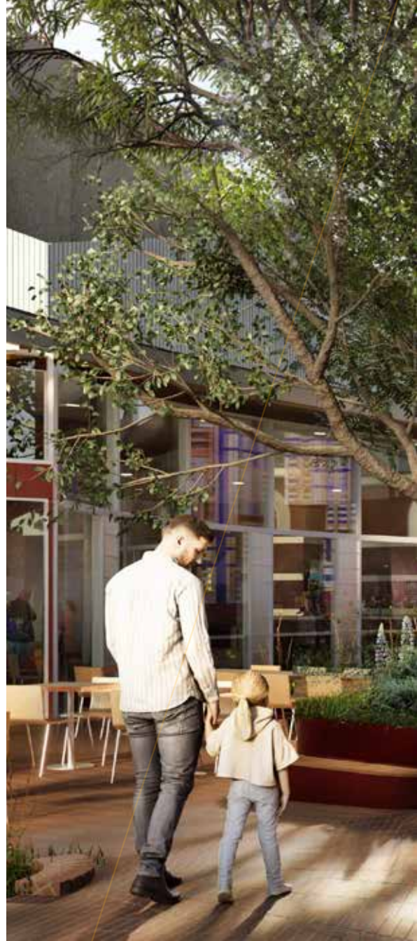
Above: The new precinct entrance follows a Bpangerang storyline about the meeting of the King and Ovens River, while its new entry tower is inspired by Wangaratta's history as a textile centre. Weaving these stories into a cohesive community narrative.

The current site holds three independent cultural services offering diverse programming to the community and visitors to the region. These venues currently face major barriers to accessibility, synergy, and activation. This prompted the Rural City of Wangaratta to future-proof these creative services, connect the site to the Railway Precinct development, and continue to enhance the liveability and cultural offerings for this major regional city.